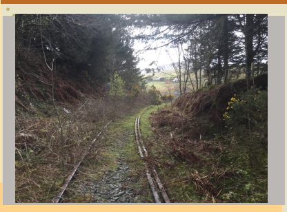
PAGE 2 Chairman's Report